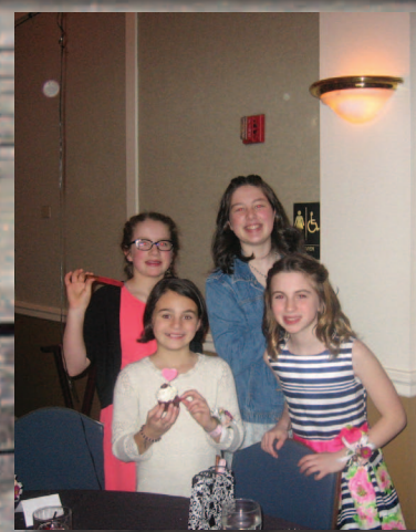
FATHER DAUGHTER DINNER DANCE