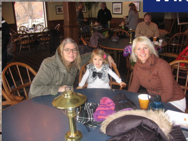
WINTER FAMILY FUN DAY